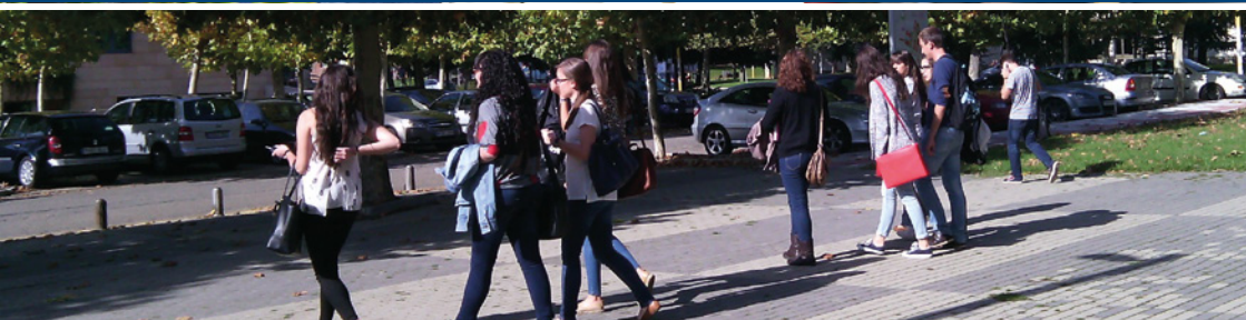
SPAIN - UNIVERSIDAD DE LEÓN