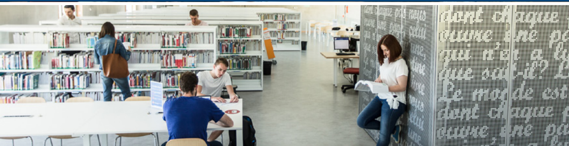
FRANCE - UNIVERSITÉ SAVOIE MONT BLANC