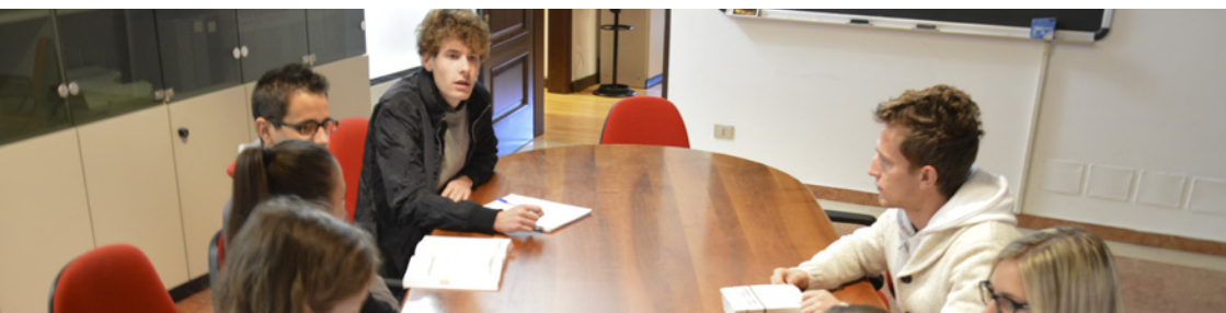
ITALY - UNIVERSITÀ DI TRENTO