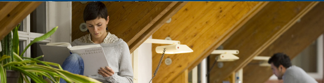
GERMANY - UNIVERSITÄT KASSEL